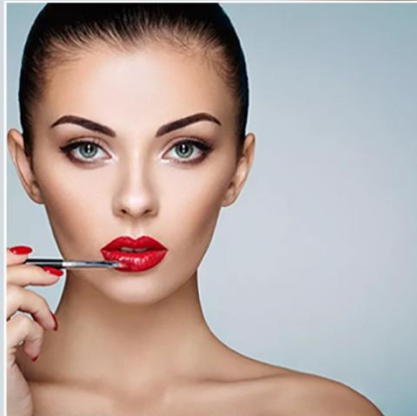
OURS High Color Rendering