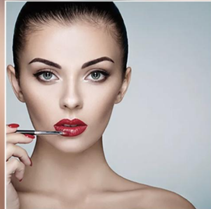
OTHERS Ordinary Low Color Rendering